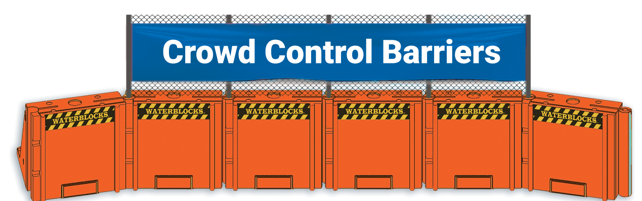
"When your mission is to provide safety. WaterBlocks is the answer!"